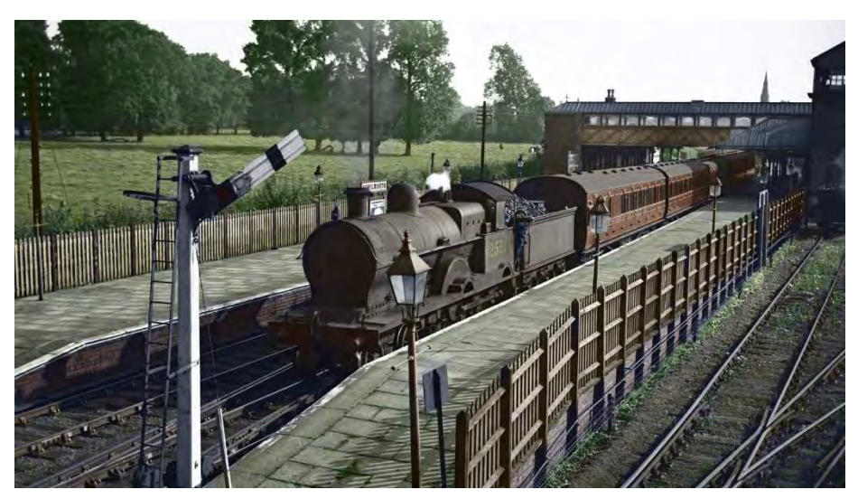
Ex-LNWR 4-4-0 Precursor Class No 25319 'Bucephalus' stands at Kenilworth's down platform in 1938