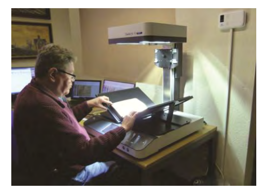
Bookeye 4 V2 Professional Archive Scanner

Our second scanner, a Bookeye 4 V2 Professional Archive Scanner, is capable of scanning case-bound documents measuring in size of up to 24.4 inches by 18 inches. It is ideal for projects which require scans of the highest standard whilst also offering maximum productivity, an important consideration for voluntary groups whose members' time is scarce. As a special add-on to the scanner, there is also a horizontally movable V-glass plate, with which the scan template can be positioned exactly in the book fold.